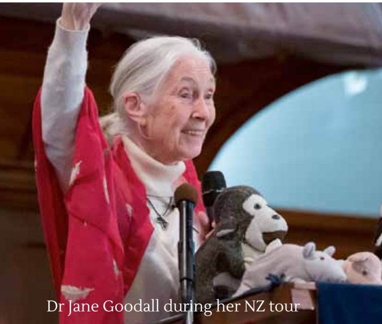
Dr Jane Goodall during her NZ tour