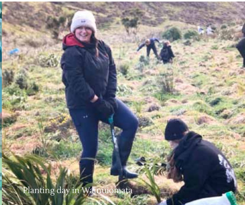
Planting day in Wainuiomata