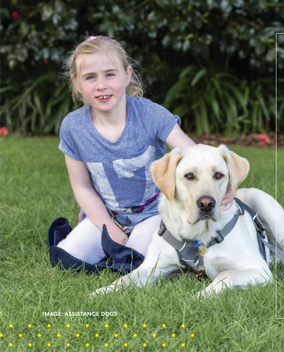
IMAGE: ASSISTANCE DOGS